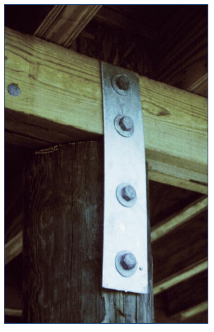
Metals corrode at a much faster rate near the ocean. Always use well-protected hardware, such as this connector with thick galvanizing. (For information about pile-to-beam connections, see Fact Sheet No. 13).

Wood decay at the base of a wood post supported by concrete.