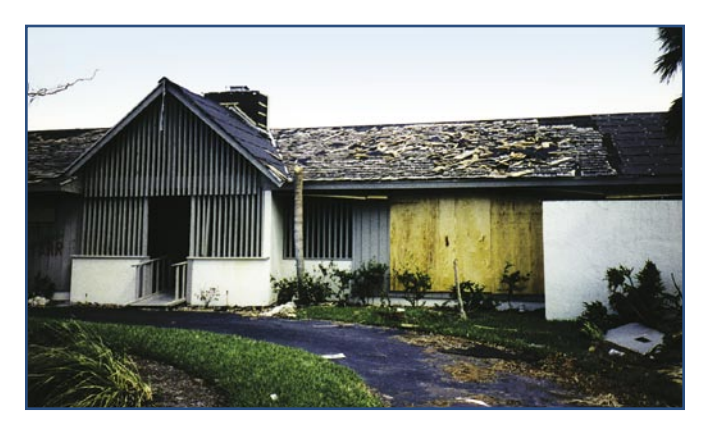
Select building materials that are suitable for the expected wind forces.

Use hot-dipped galvanized or stainless steel hardware. Reinforcing steel should be protected from corrosion by sound materials (masonry, mortar, grout, concrete) and good workmanship (see Fact Sheet No. 16). Use