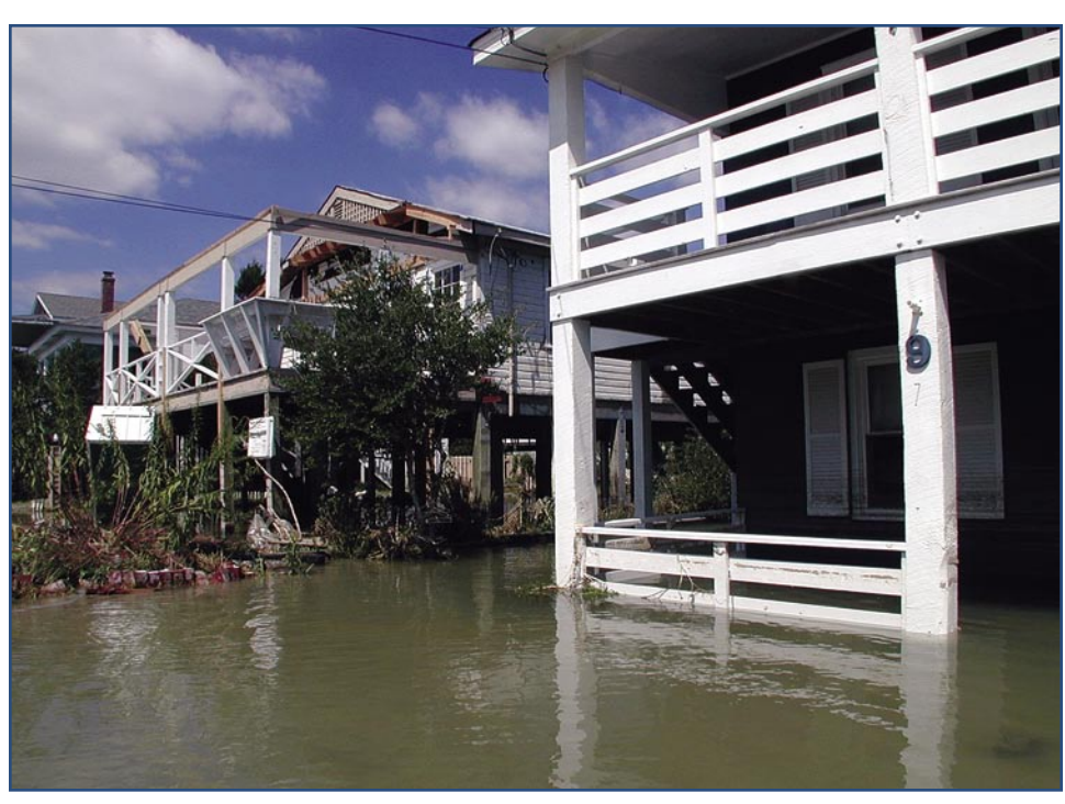
Select building materials that can endure periodic flooding.